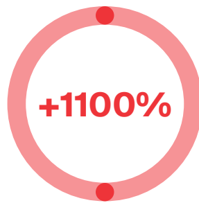
Jet fighter flights at Wangaratta