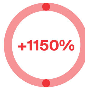
Hot Air Balloon Flights all around the country