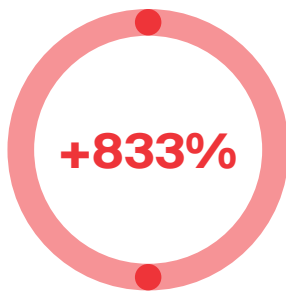
Mystery flight packages with overnight stays

Experiences in the $500+ category with the highest year-on-year growth, comparing Jan-May 2023 to Jan-May 2022